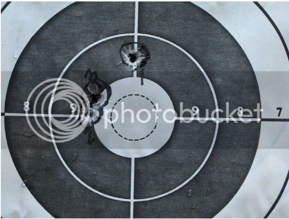
He took 1 Shot at a Target, and one Shot at a Water Jug... Water jug exploded..... Here is his ONE SHOT AT 400 yards....