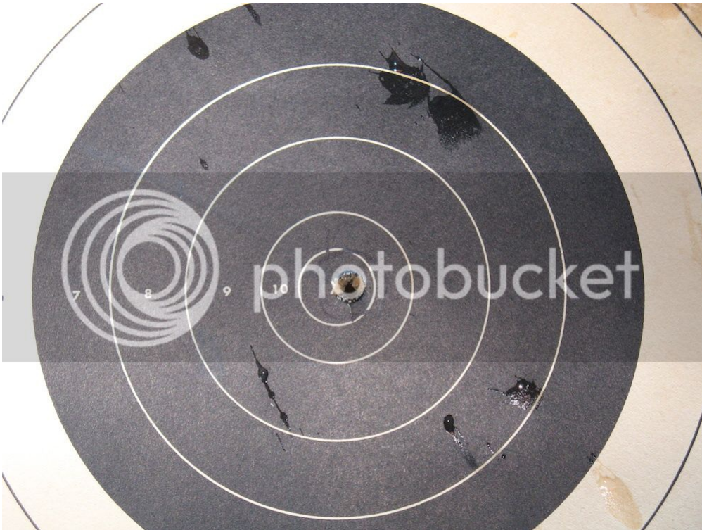
If I done that at 400 Yards, I might NEVER SHOOT AGAIN and call it a day, as I would never be able to do that again...