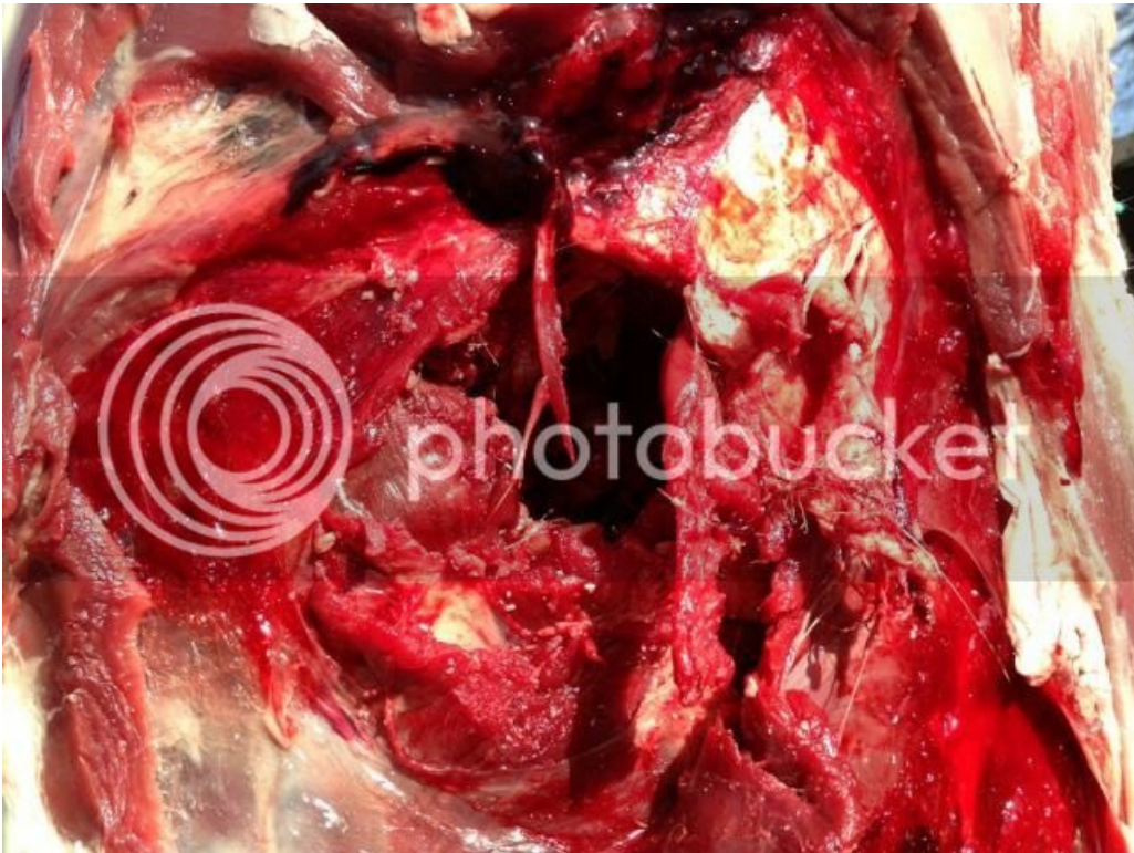
This one and only petal was found during the meat grinding process. My grinder did chew on the copper a bit but it was mostly intact. The other 3 exited the body. This one smashed the right shoulder blade (see pics below)