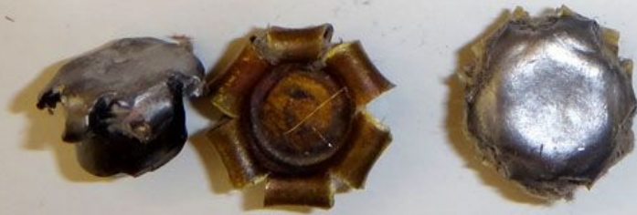
I found some OLD Silver Tip Loads, these are Factory loads from years ago.....