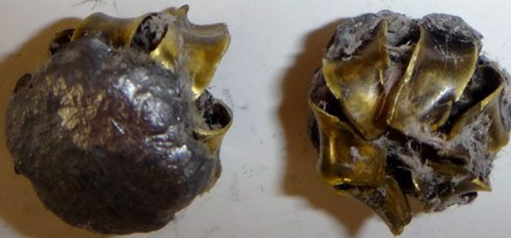
Had some factory Hydros laying around also....