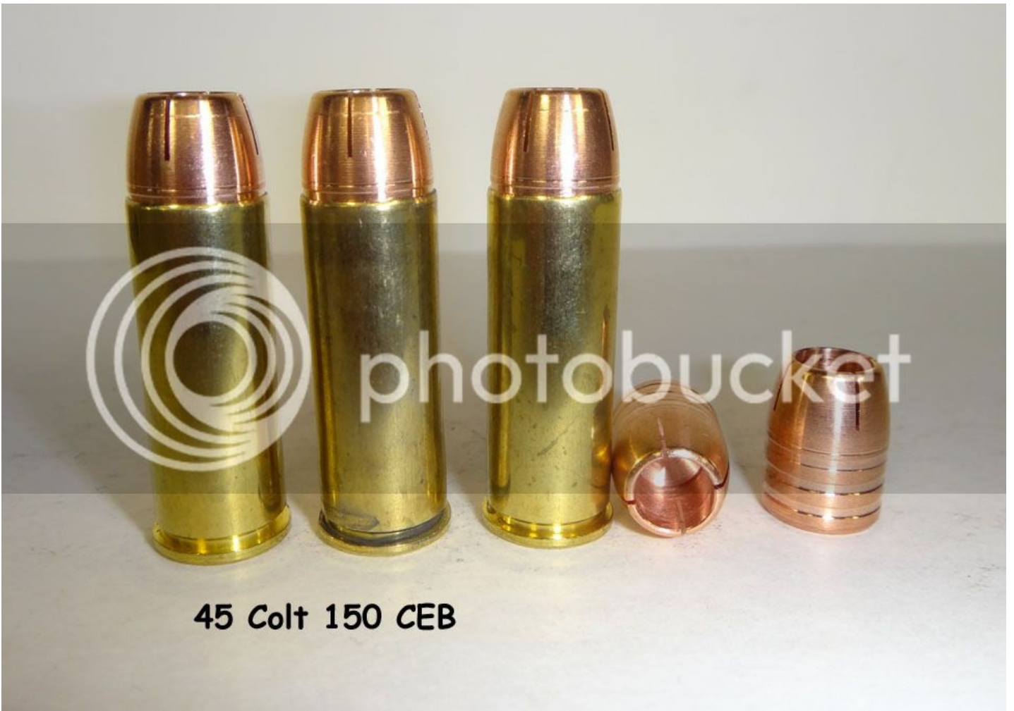
45 Colt 150 CEB