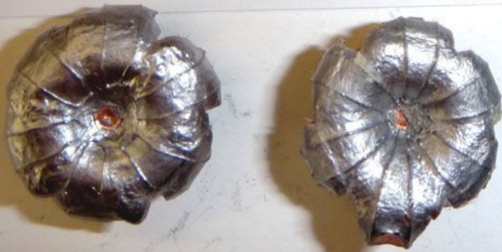
230 Saber is just claws and teeth.....

45 ACP Kimber 1911 5 Inch Barrel 9/2013 200 Gold Dot Muzzle Velocity 969 fps 7 Yard Impact Retained 200 X2-5.5 Inches