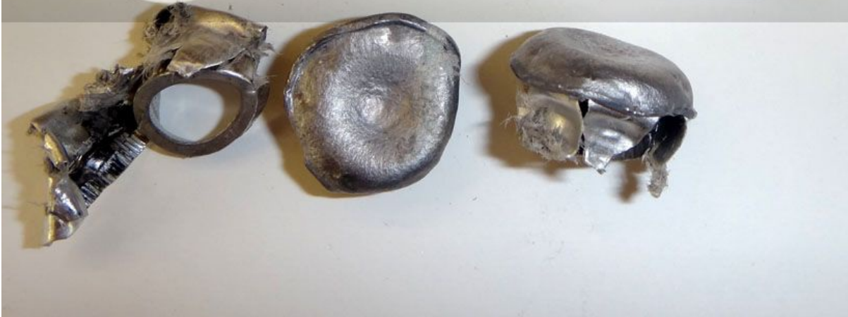
This 200 Hornady is a good tough bullet.....