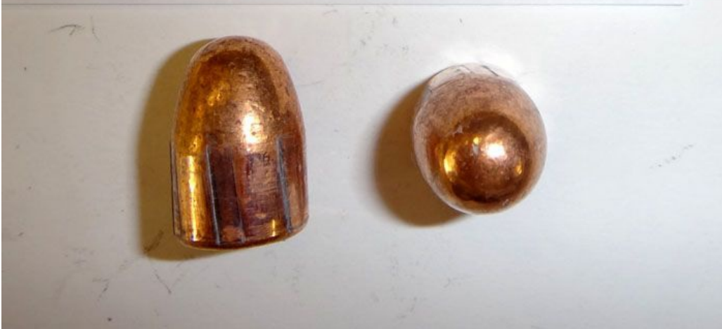
Always a favorite for the deepest penetration in 45 ACP, 230 Hornady Flat Nose.....

7 Yard Impact Retained 230 X2- 10 Inches