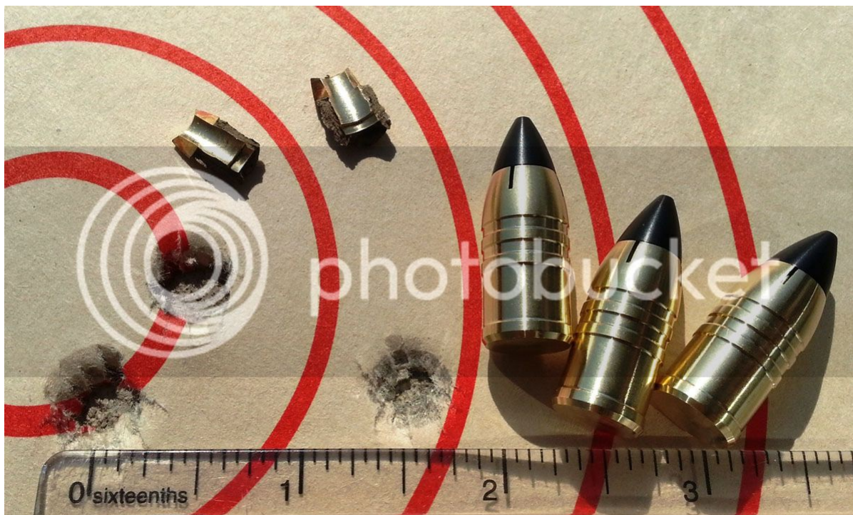
Below is what Trapper sent to me this morning.....