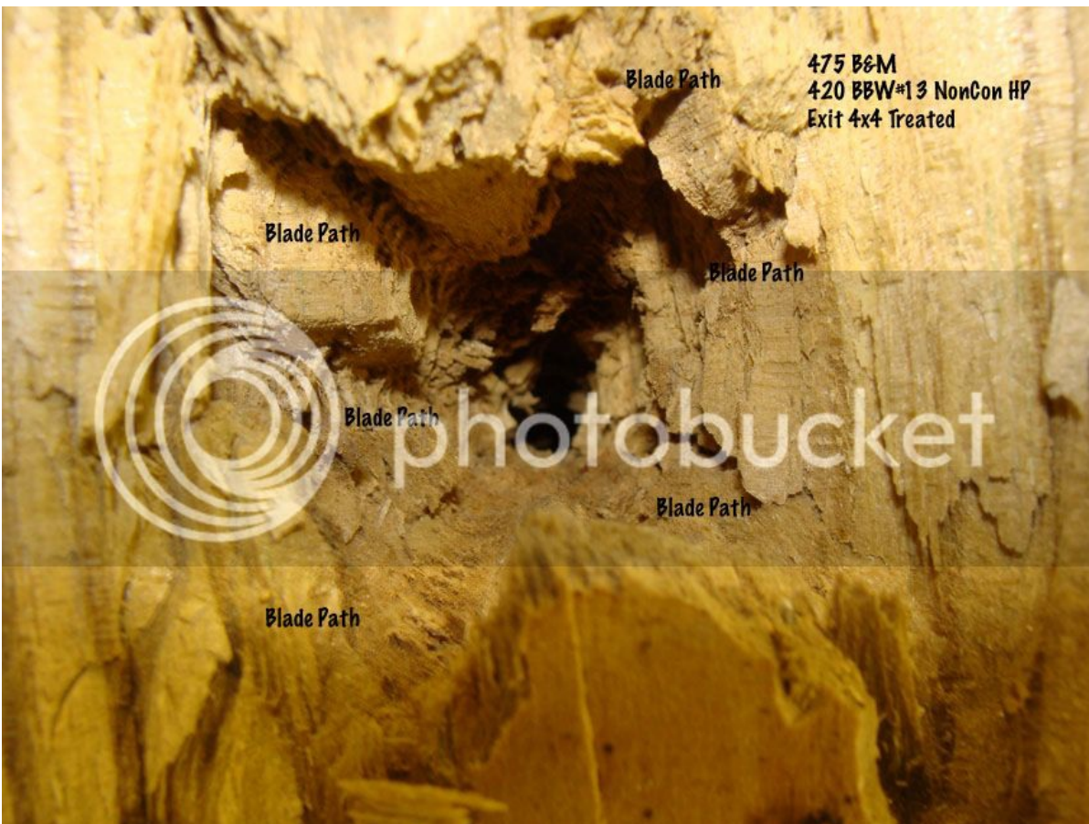
Now all ya'll use your own judgement, if you still doubt then that is fine with me.... I have used my judgement on the matter, you can do the same...

Enjoy, looks to be a fantastic weekend here in SC, warm weather, Sun Shine..... And wish I had some