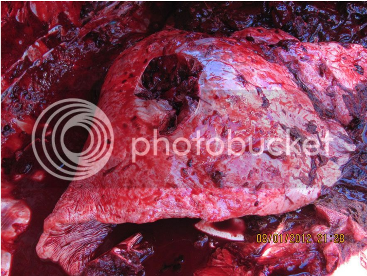
This is a frontal shot on a buffalo with 500 MDM and 460 #13 NonCon, this heart was nearly cleaved completely in two..... Blades were working with center bullet to do this.....