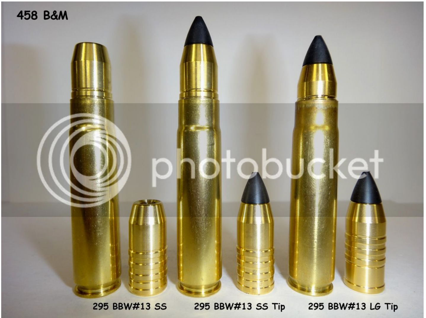
295 BBW#13 SS