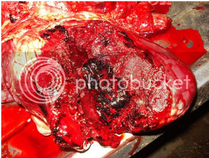
Buffalo heart, frontal shot, 420 BBW#13 NonCon 458 B&M 2250 fps.

Buffalo Heart from 500 MDM 460 BBW#13 NonCon 2400 fps--This is cleaved in half--bad photo was taken in the dark in the shed.