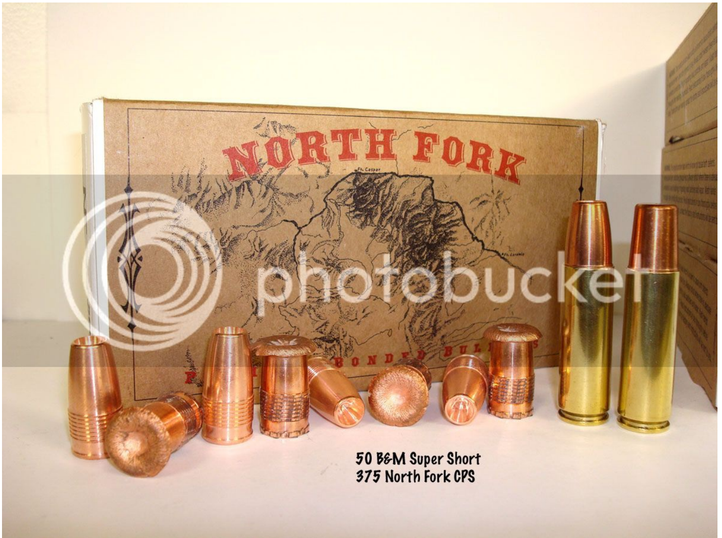
50 B&M Super Short 375 North Fork CPS