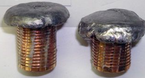
.500 caliber North Fork CPS

450 North Fork Premium Muzzle Velocity 2292 fps 22 yd Impact X1--22 Inches Penetration