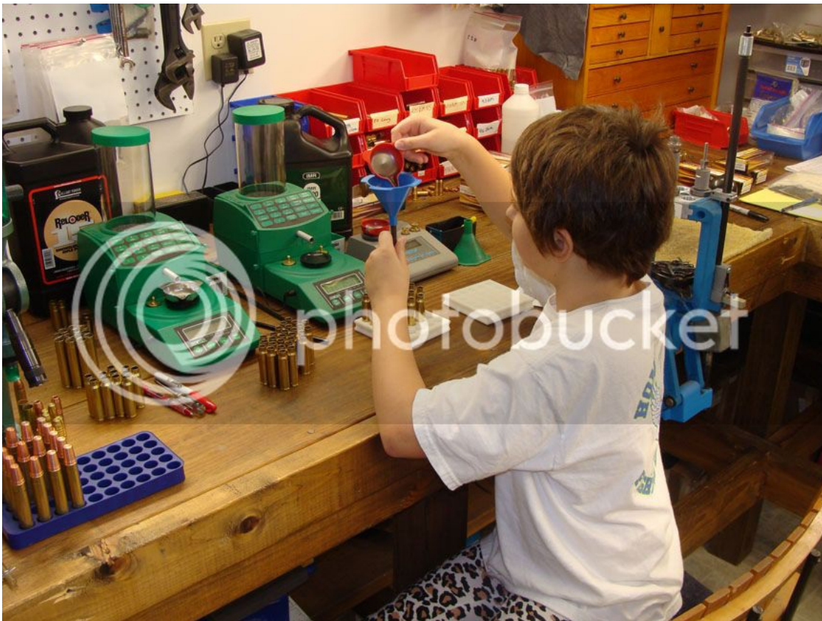
Here, waiting on the ChargeMaster, only had one running for these particular loads, she did not mind the short wait!