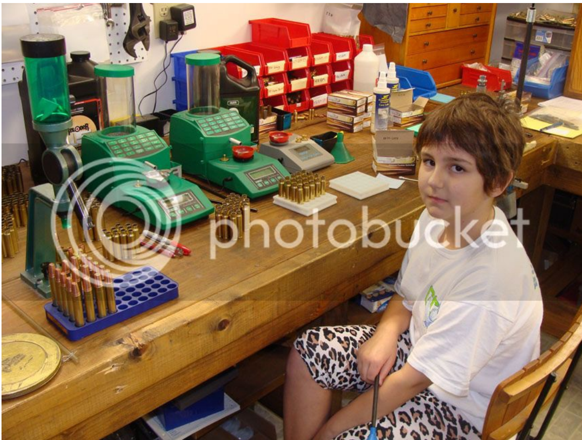
And once she had everything charged up, I felt that she should have the opportunity to "Finish The Job", and she did so with ease!