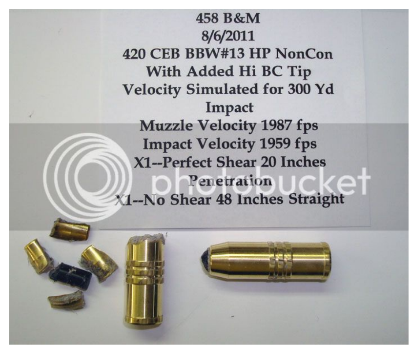
As you see, one did not shear, above, and the one that did penetration was a bit short of normal, which I attributed to the lower velocity, trying to simulate a 300 yd impact. Now even the ones we tested at high velocity just did not seem stable either, which was bugging me a bit too?

But just to review a bit so's you don't forget;