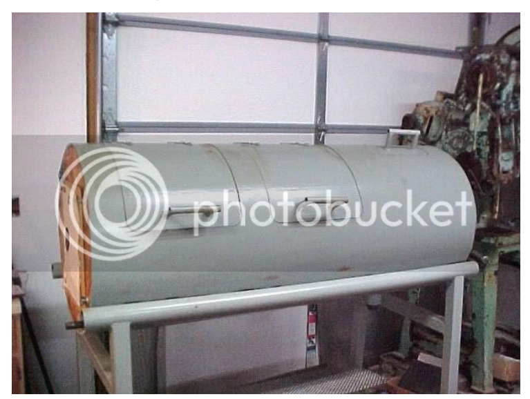
And of course the other setup was for North Fork bullet testing, hatches open and force field off:

Here is the setup for testing RN solids, hatches battened and force field on: