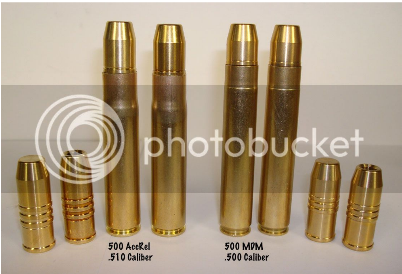
500 AccRel .510 Caliber