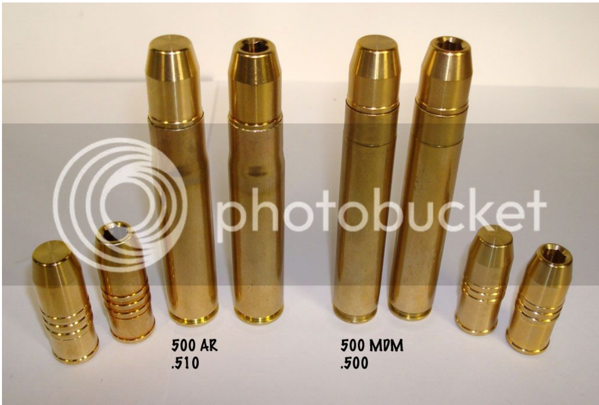
500 AR .510