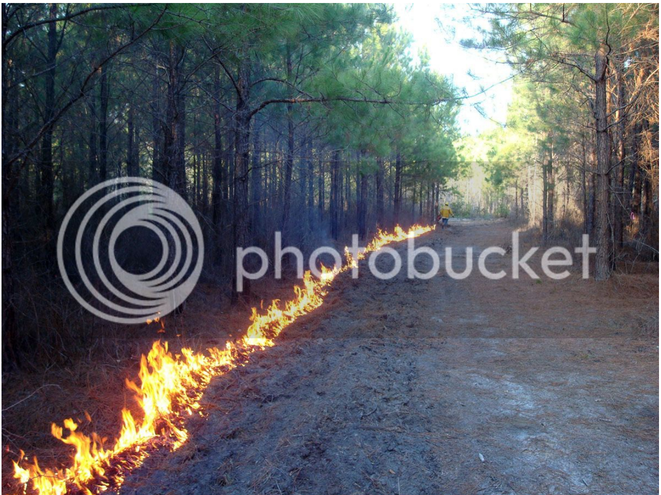
At night the humidity goes up, temps are cooler, can let some roll without doing damage