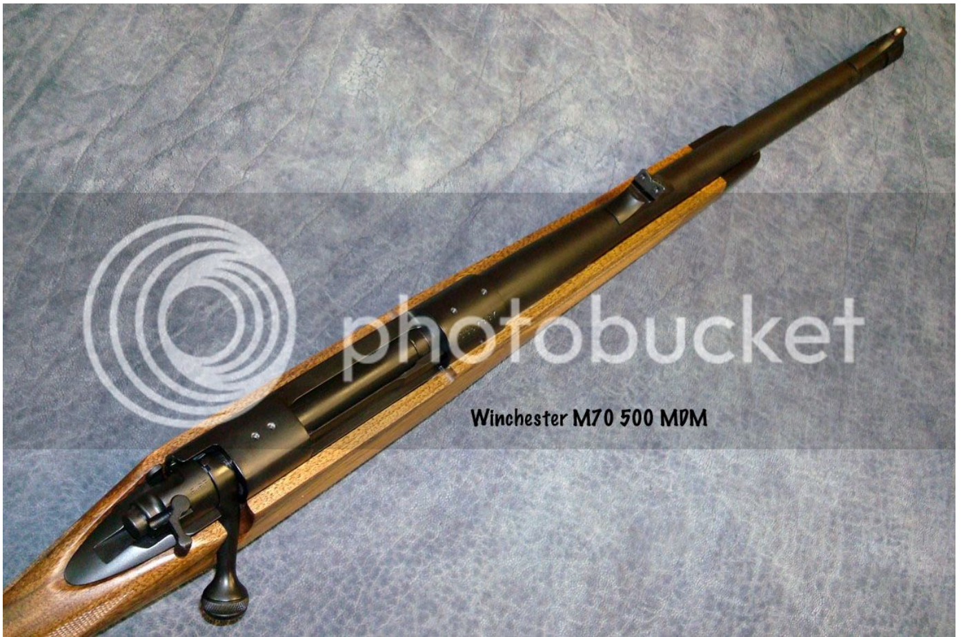
Winchester M70 500 MDM