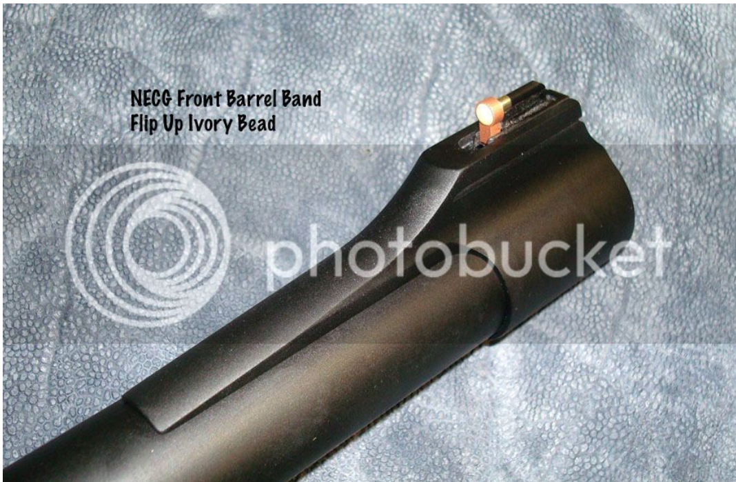
NECG Front Barrel Band Flip Up Ivory Bead

This is the brand new Gun #1 475 B&M Super Short! Another Hillbilly Gun, all camo and such! YEHAHHH..... 🤖