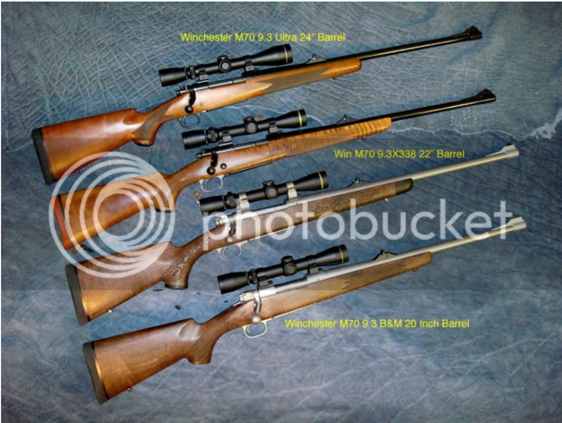
Winchester M70 9.3 Ultra 24" Barrel

I got on a 9.3 kick a couple of years ago, built a couple of 9.3X338s with 22 inch barrels, and lord knows I wasted a good RUM action on a 9.3 Ultra. Along about the time the big Ultra 9.3 was done, so was the 9.3 B&M. I spent my time with the 9.3 B&M and have not even started load data on the 9.3 Ultra. I can see no point in it, I would never carry that big Ultra anywhere. Even the 9.3X338s are large rifles when compared to the little B&M rifle. So they sit in the rack with nothing to do too. You can't really see how much smaller the B&M is compared to the others in this photo, but there is considerable difference in overall size of the rifles and feel.