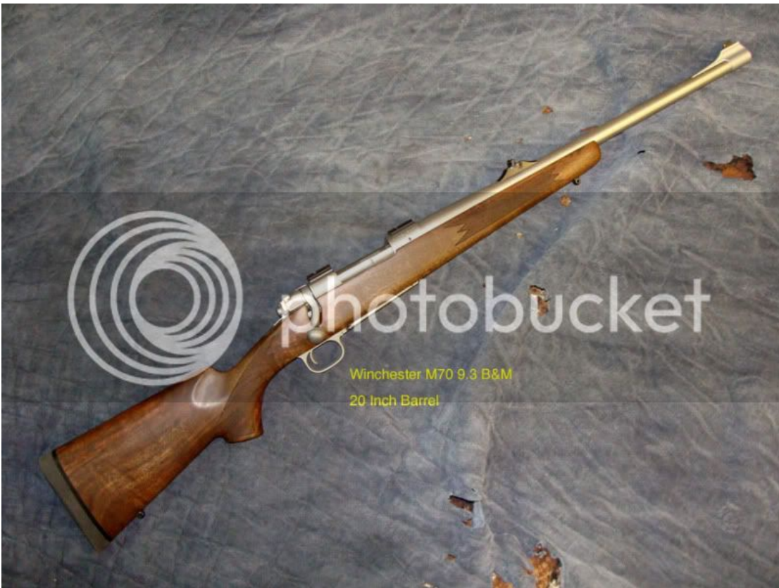
Winchester M70 9.3 B&M 20 Inch Barrel

I got on a 9.3 kick a couple of years ago, built a couple of 9.3X338s with 22 inch barrels, and lord knows I wasted a good RUM action on a 9.3 Ultra. Along about the time the big Ultra 9.3 was done, so was the 9.3 B&M. I spent my time with the 9.3 B&M and have not even started load data on the 9.3 Ultra. I can see no point in it, I would never carry that big Ultra anywhere. Even the 9.3X338s are large rifles when compared to the little B&M rifle. So they sit in the rack with nothing to do too. You can't really see how much smaller the B&M is compared to the others in this photo, but there is considerable difference in overall size of the rifles and feel.