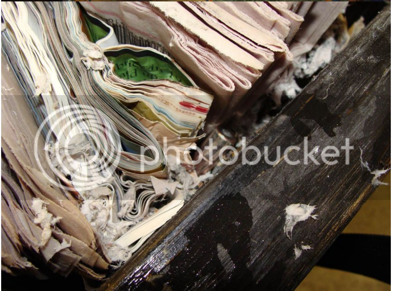
The 500 Barnes Banded FN zipped thru the entire 62 inches of test medium and exited the back of the box, 2X6 and into