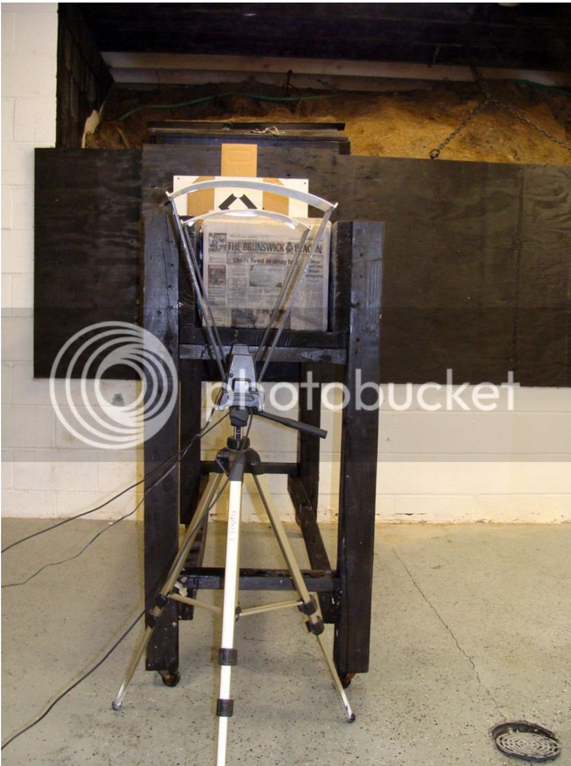
The test medium was fresh and soaked well, 62 inches of mix in the box.