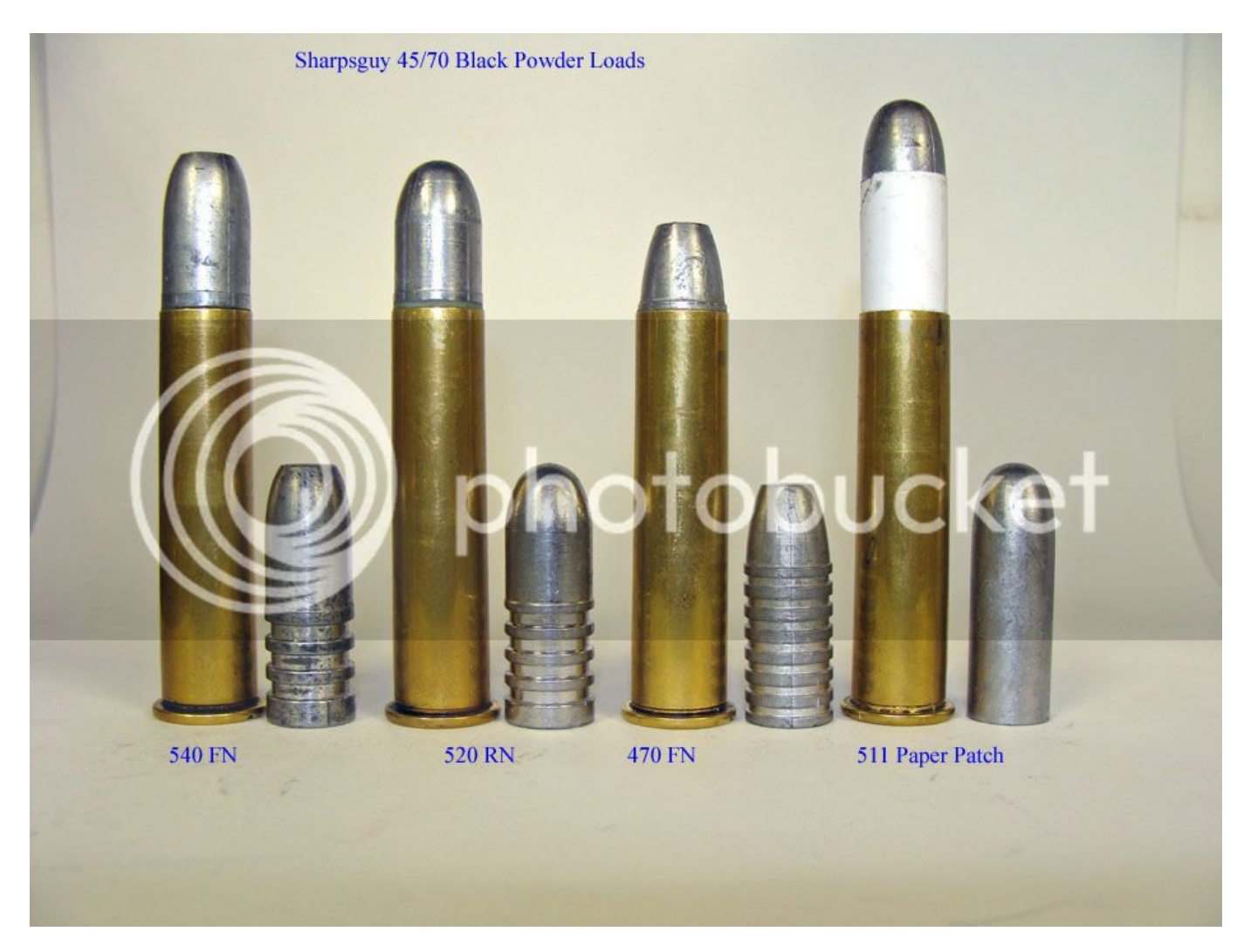
First let's look at the 540 Cast FN.