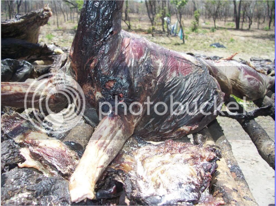
entry on inside of left front leg

The poor man's version is the 416 Ruger Alaskan. It will do 2600fps with 350 grain bullets. For me, 2600 fps is a minimum for plains game. You might need to shoot a little oribi at 201 yards. Non-cons could lighten and flatten that some more, too.