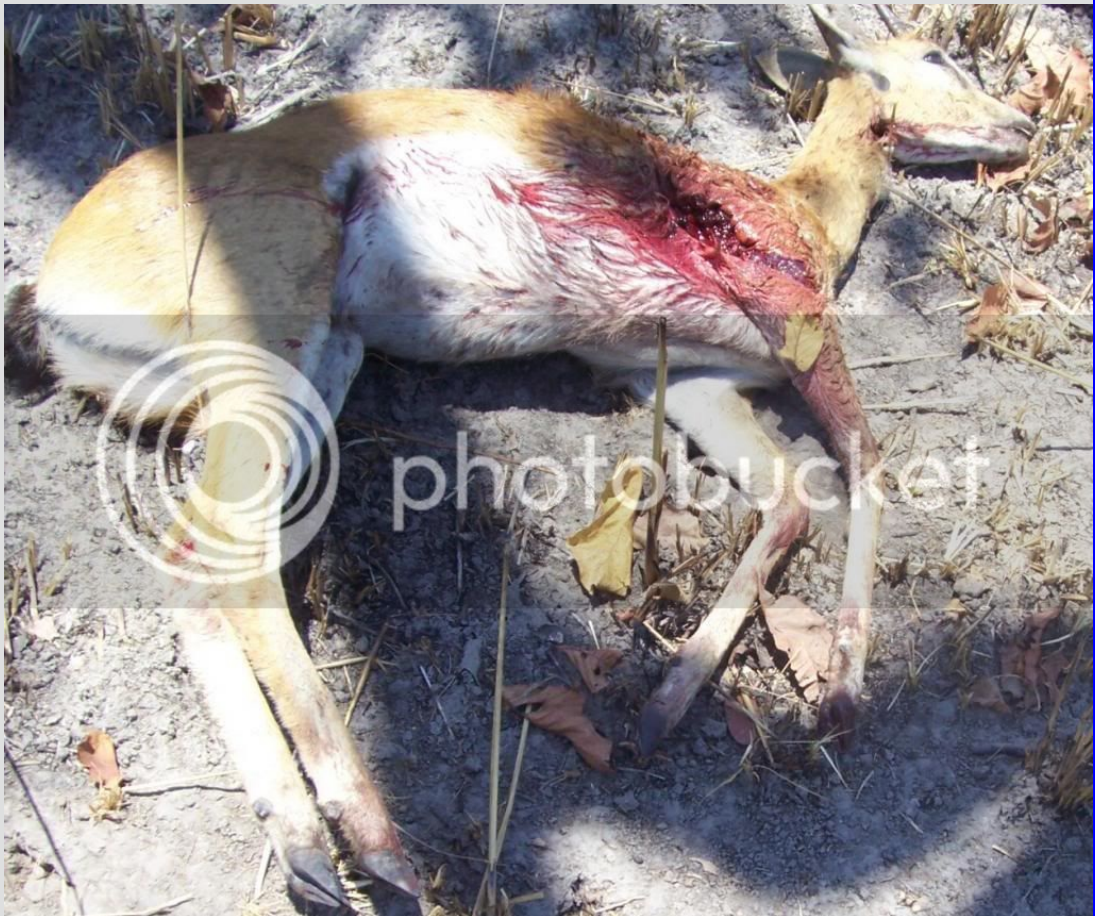
exit blew out heart, offside, 201 yards, 35 lb. animal. 416 is enough gun. (the same animal is in the pictures, one pic is after skinning and 24 hours partial drying/smoking.)