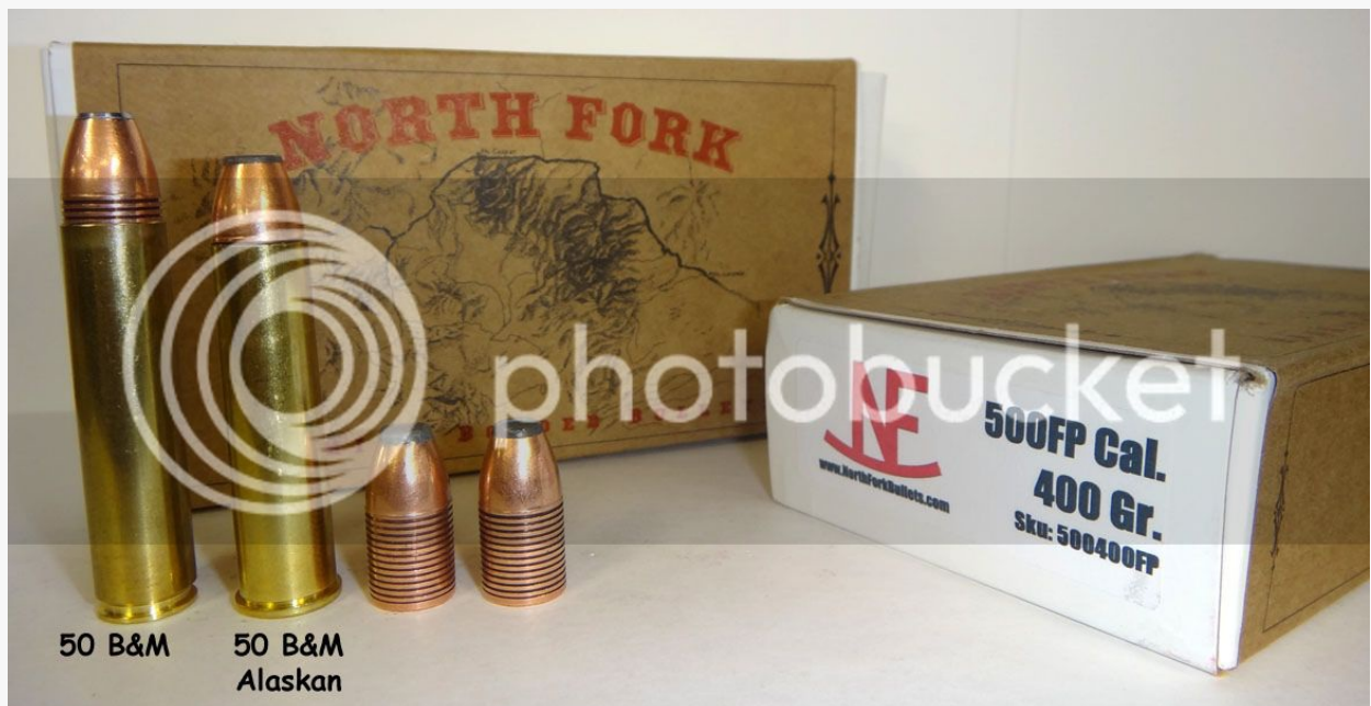
The 50 B&M Alaskan is of course the lever cartridge, and on a Marlin Guide Gun, 18 inches. In the load data I was able to safely get over 2100 fps with the 400 North Fork with 3

michael458 One of Us posted 01 November 2012 19:22 Hide Post Got some great work in yesterday with the 50 B&M Alaskan and 50 B&M with the new 400 gr North Fork Premium Soft Point. I like this bullet, and for a conventional, it does great, and will serve the purpose well for those who still like and need a conventional soft.