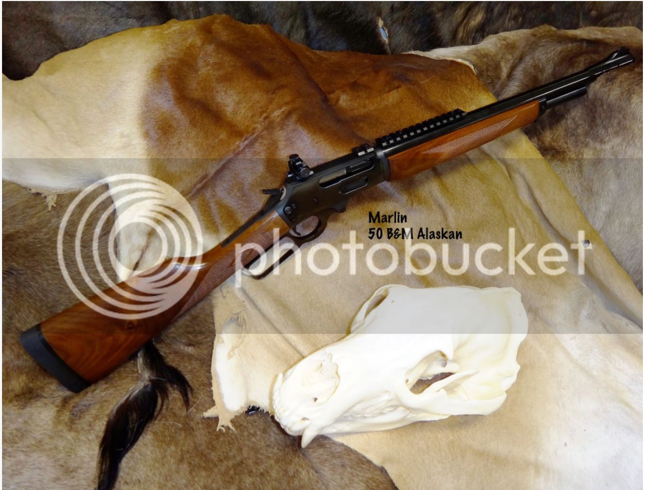
Marlin 50 B&M Alaskan

different powders, IMR 4198, H-4198, and RL 7.