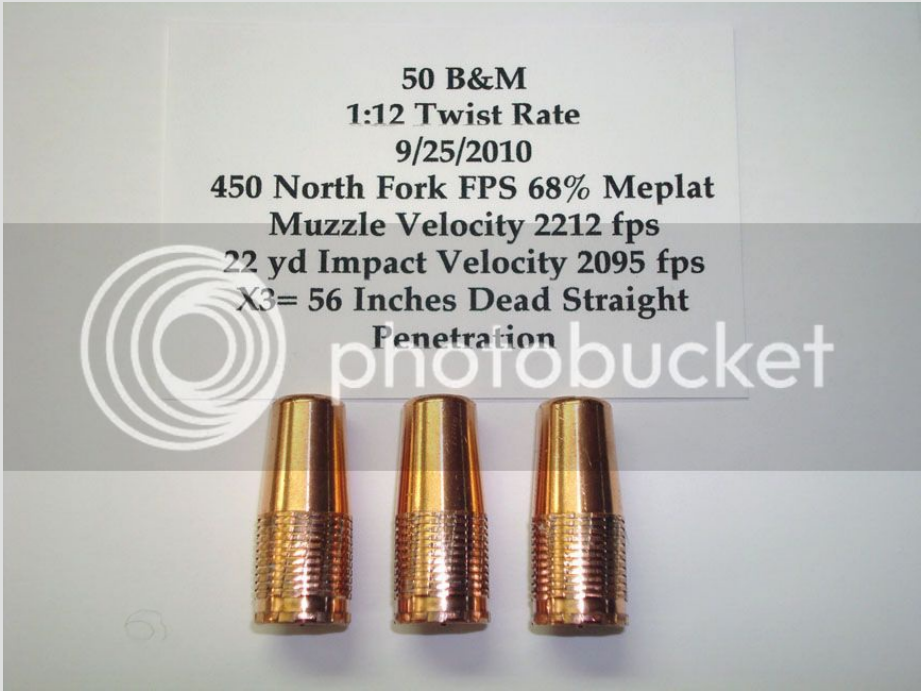
Now enter the 450 North Fork FPS, New Nose Profile, and yet again an increase in performance, and feed and function 100% perfect.