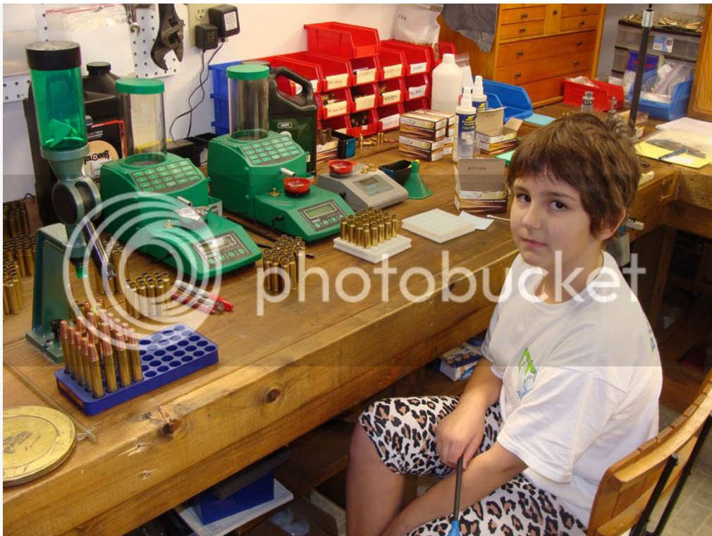
And once she had everything charged up, I felt that she should have the opportunity to "Finish The Job", and she did so with ease!