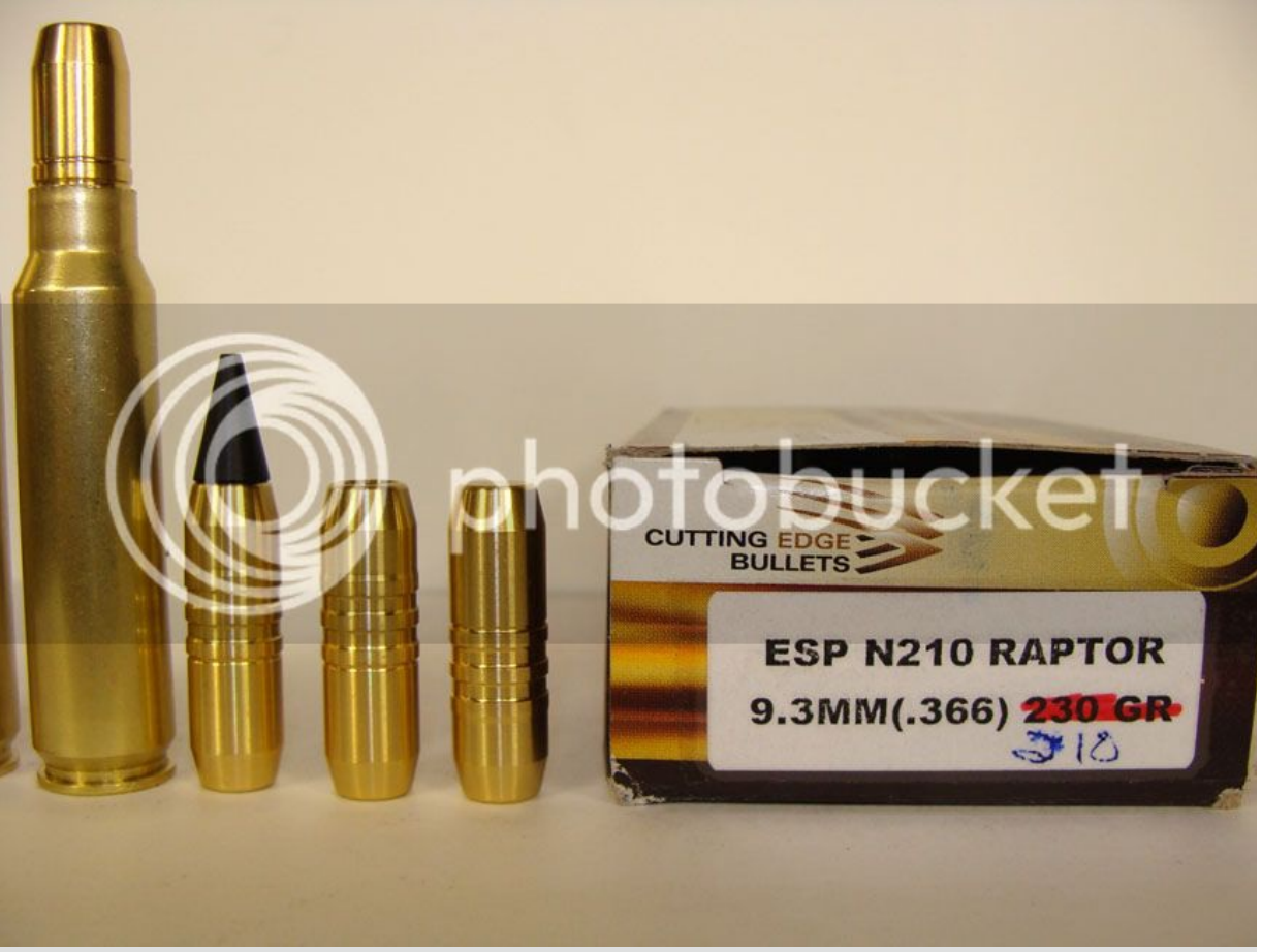
First I was extremely curious as to what velocity I could run them in the 9.3 B&M, and a 20 inch barrel. I had a load of 71/RL 15 with