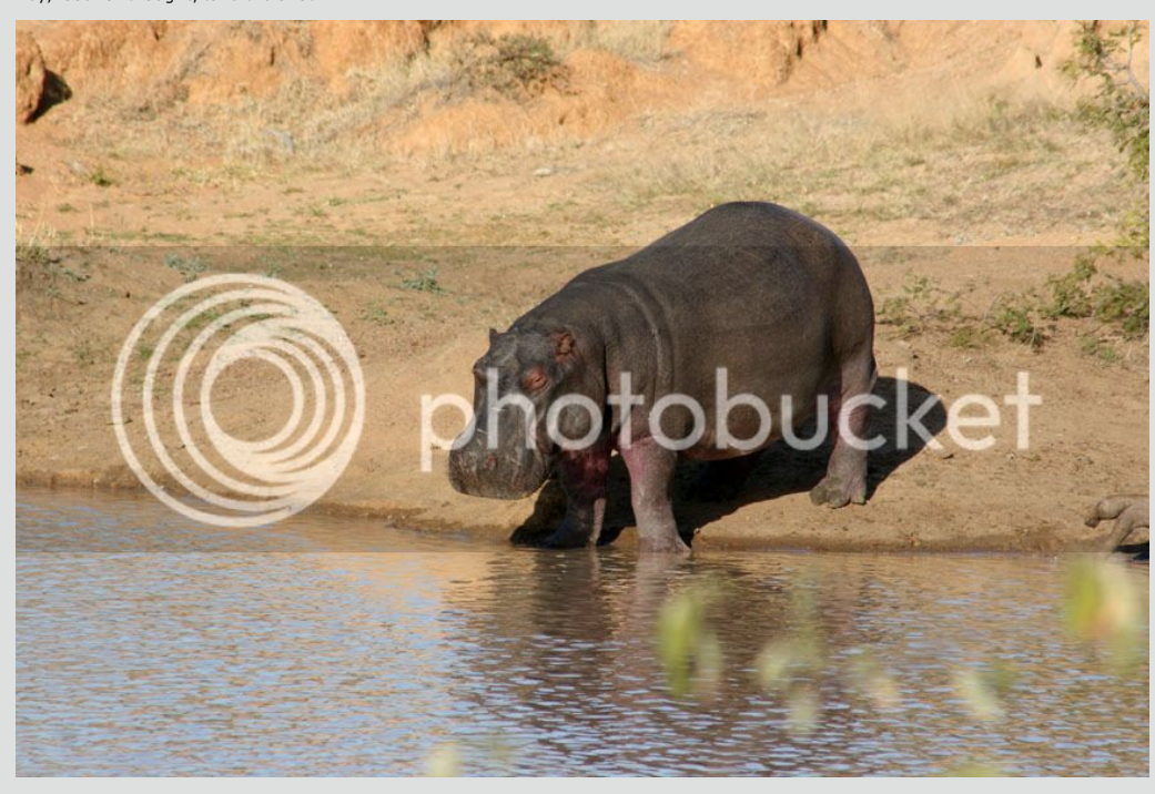
Oppps, better not take the shot!