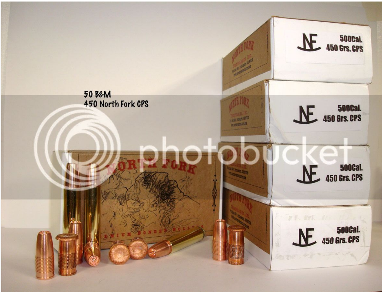
50 B&M 450 North Fork CPS