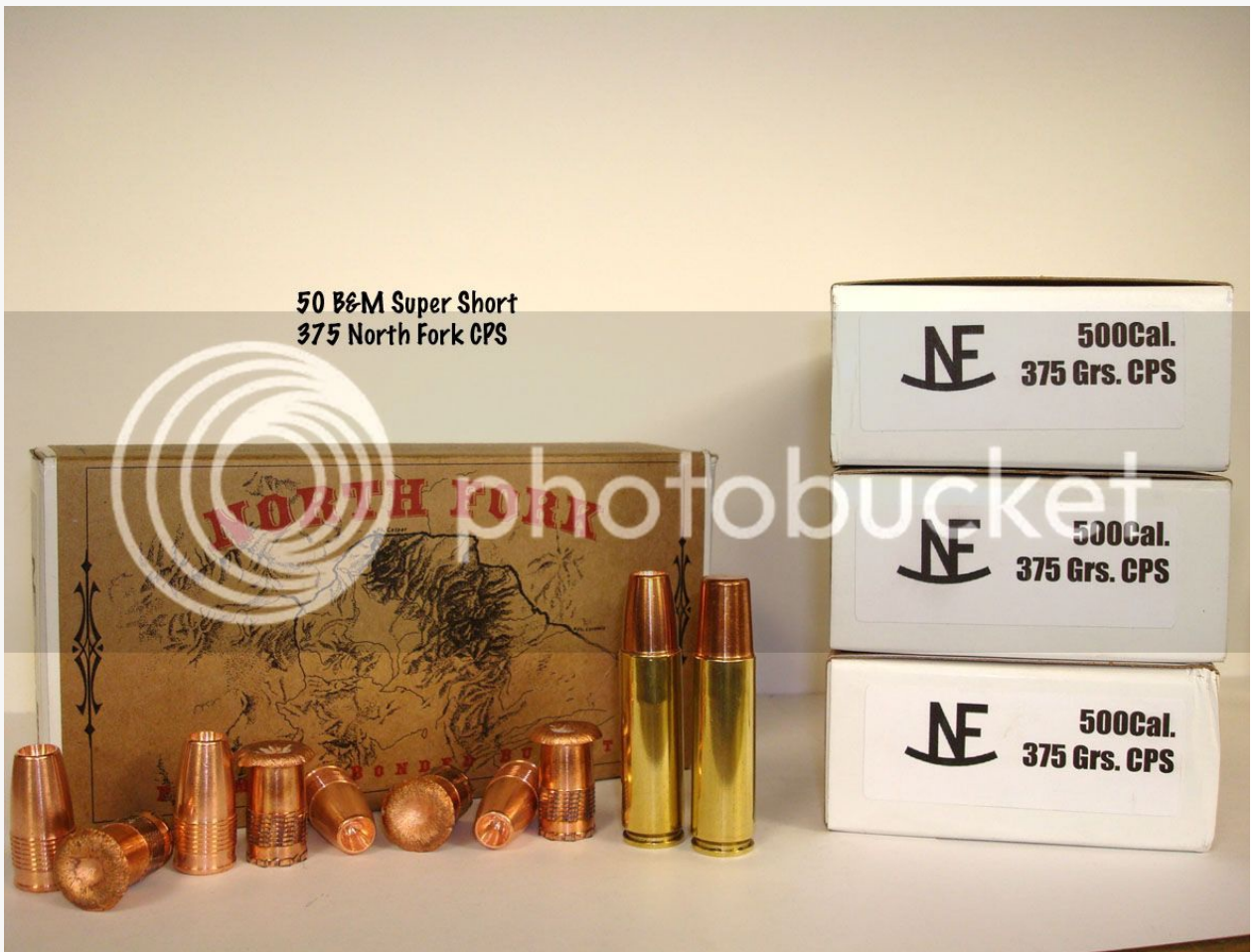
50 B&M Super Short 375 North Fork CPS

I am a very happy camper with these, and can't wait to put them to work!