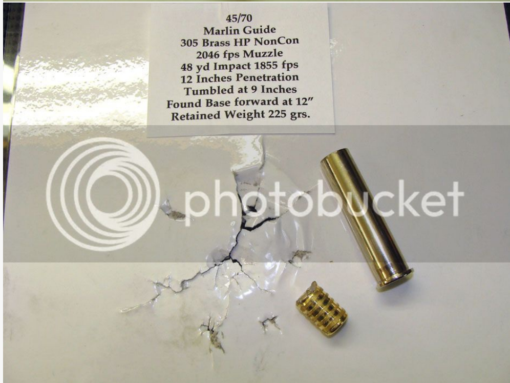
Testing low velocity in the 458 B&M it did very well. Twist rates!